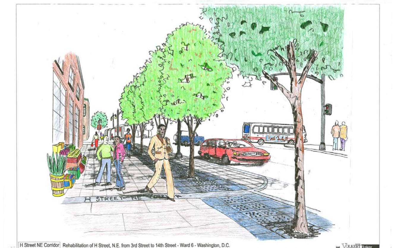
DDOT's rendering of proposed H Street, NE sidewalk improvements

The concrete sidewalks will be replaced with 4-foot by 4-foot squares of exposed aggregate concrete. Sidewalk bulb-outs will be constructed for transit stops (to be used at present by Metrobuses) at 5 th , 8 th , and 13 th Streets, NE and will also define the ends of parking lanes. The grade of the bulb-outs will rise from 8 inches at their inner edges to 14 inches at the curb so that persons with disabilities can board buses and possible future streetcars at grade. Twenty-foot teardrop light standards will be installed. Street trees will be plants in pits that will be connected below grade so that the tree roots can expand more fully.