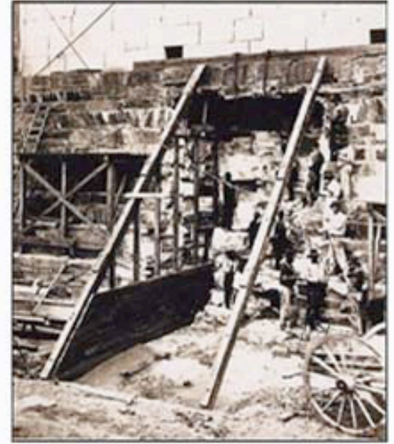
(b) Buttress Construction 1879