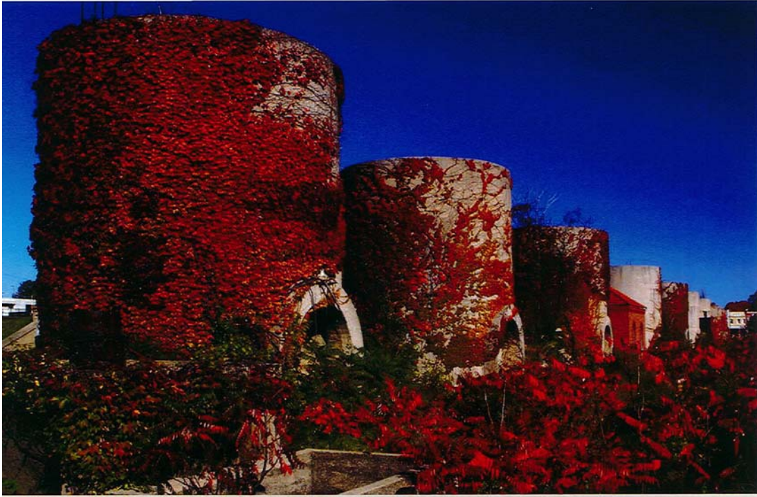
2526 Boston Ivy-clad sand towers of the North Court