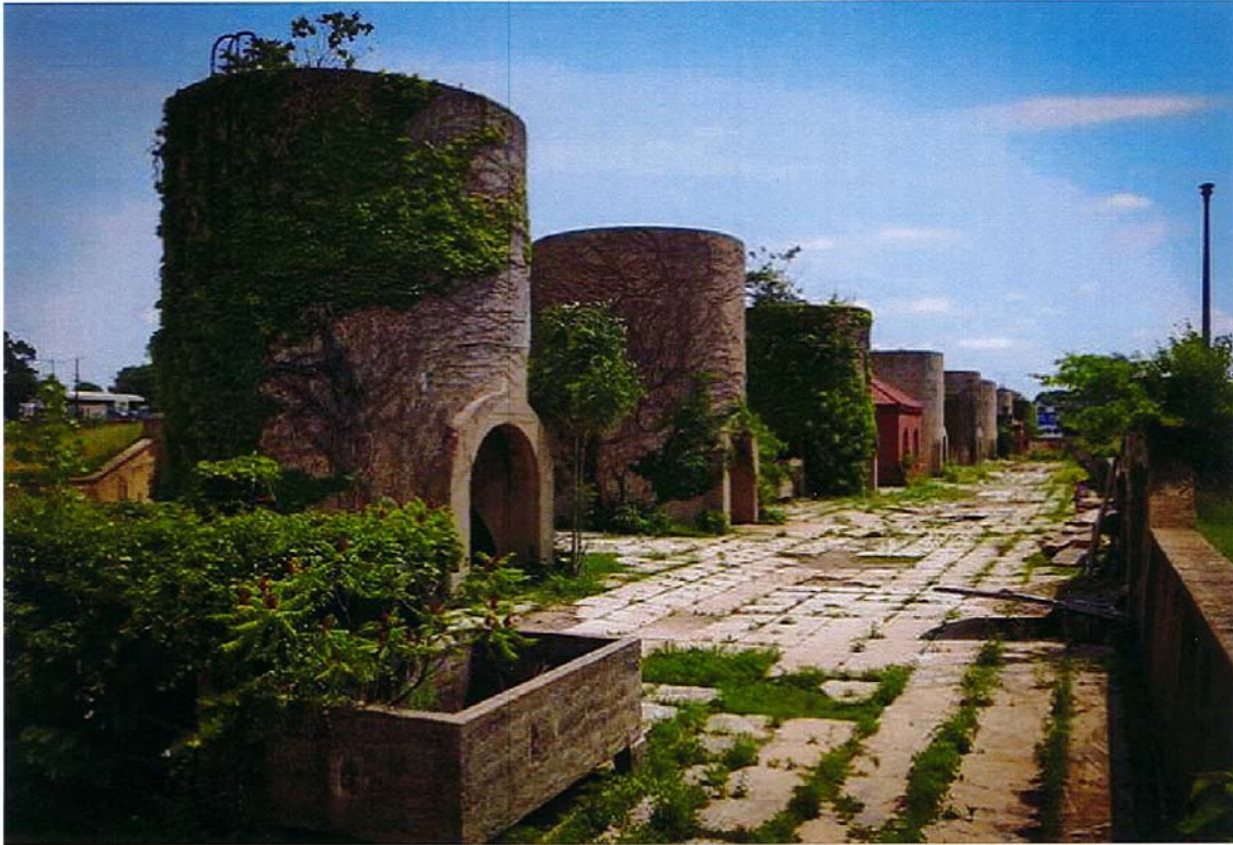
2538 Row of sand towers and hopper

The proposed development would significantly change the character of the site. Some open space would remain along the southern boundary of the Site, and the sand towers would remain on a horizontal axis towards the north end of the park, but they would be dwarfed by the new buildings being constructed. Below is the proposed land use map presented by the applicants during the hearing (HPA 14-393 R. 521), followed by an architect's rendering of how the sand filters would stand in relationship to the new commercial buildings on the Site (HPA 14-393 R. 663).